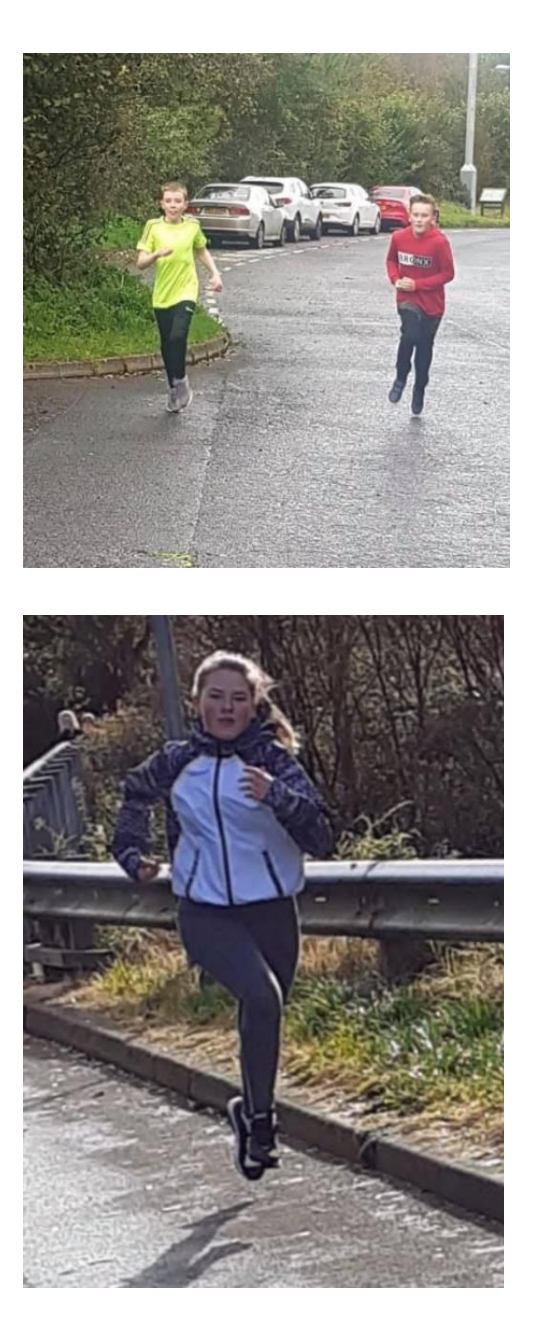
Students completing their one mile challenge

Years 8-12 have been taking part in the Irish Life 'Run for Fun' Programme. This is a programme aimed to increase activity levels of entire schools by encouraging engagement in recreational running in students of all levels of fitness. It also aims to give students an increased awareness of the importance of living an active and healthy lifestyle. The 6-week programme took place during the students' PE lessons and the classes then undertook the one mile challenge at the Ecos Centre. Well done to all those who participated!