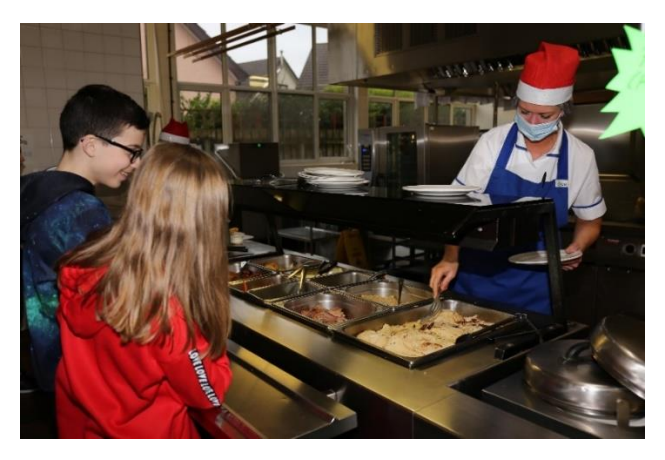
Students enjoying their Christmas dinner