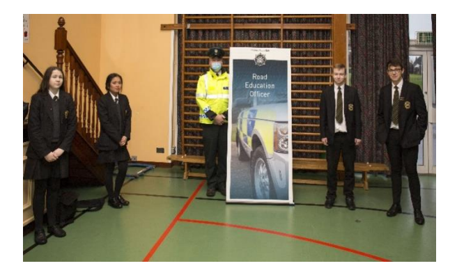
Students at the Road Safety Assembly

Many thanks to the Road Policing Authority for giving such an important talk about the potential consequences of making poor decisions on the roads.